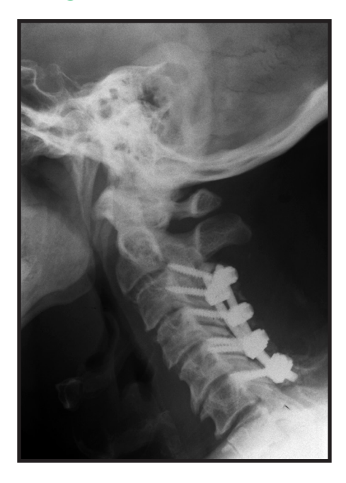
X-ray showing rod and screws in cervical spine

To achieve a spinal fusion, a bone graft is used to connect two bones together. The patient's own bone will then grow into